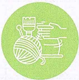
Retail & Gifts, Handicrafts, Homewares