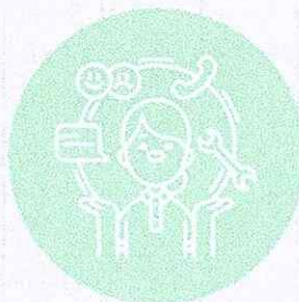
Service & Health and Wellness