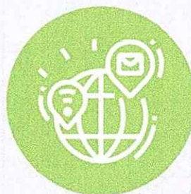
Creatives & ICT/ Digital